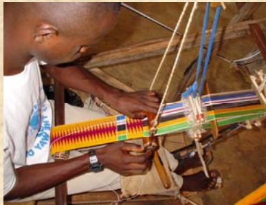
KENTE STRIP WEAVING